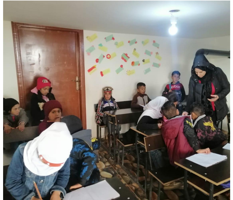
STAYING WARM IN ONE OF THE FOUR CLASSES IN SESSION