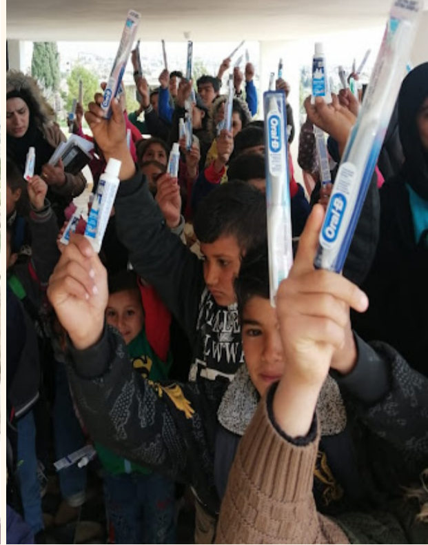
Each student (95 of them) received a toothbrush and toothpaste donated by Owens dental in Fort Collins, Colorado.