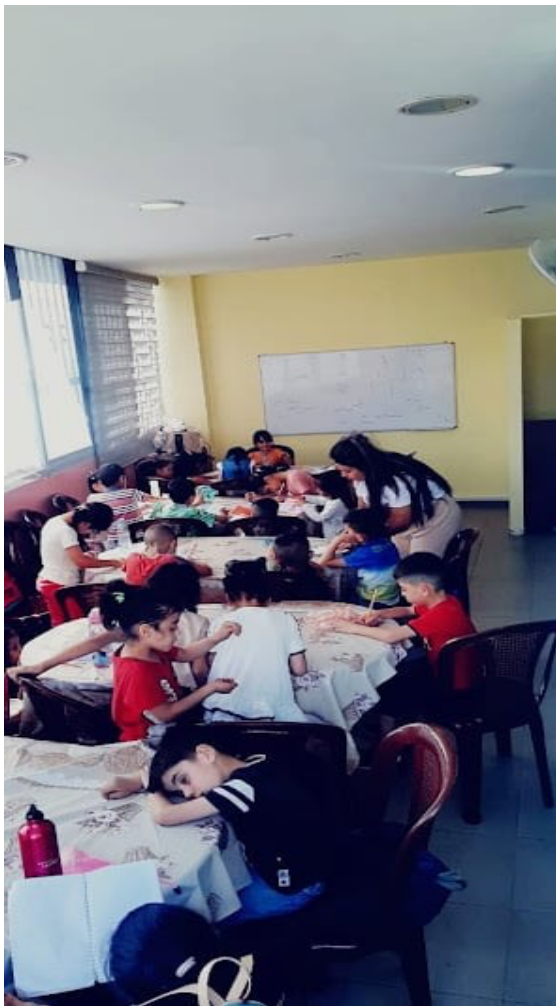
School is hard! Sometimes you just need a nap.