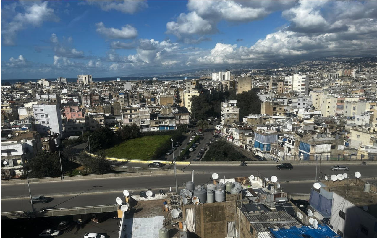
Figure 1 - A view of Beirut with the mountains beyond