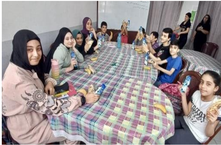
Level 3 students enjoying a snack